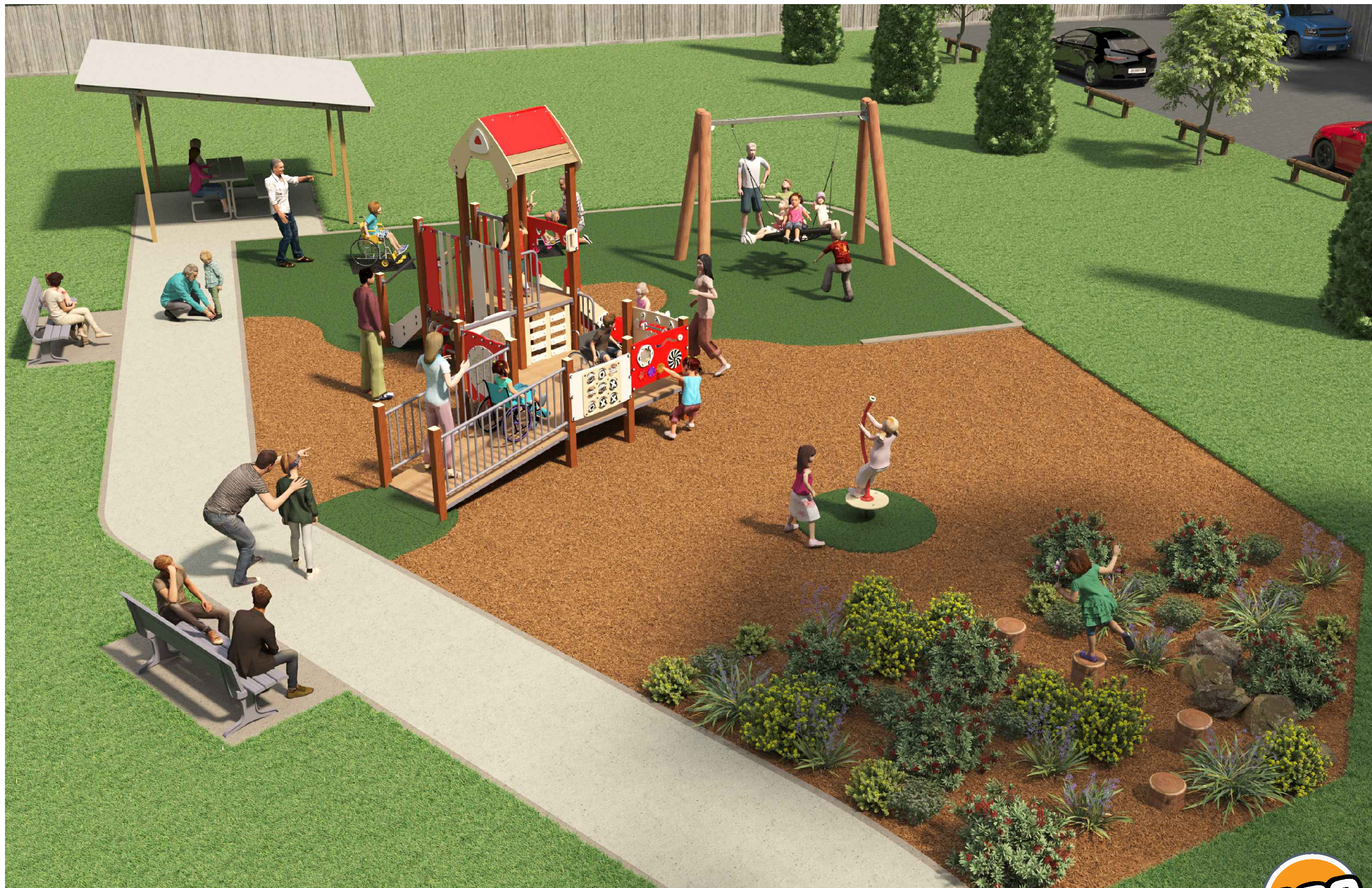
CHURCH RD. PLAYGROUND - WINGECARRIBEE S.C. - OPTION 2 - #2247