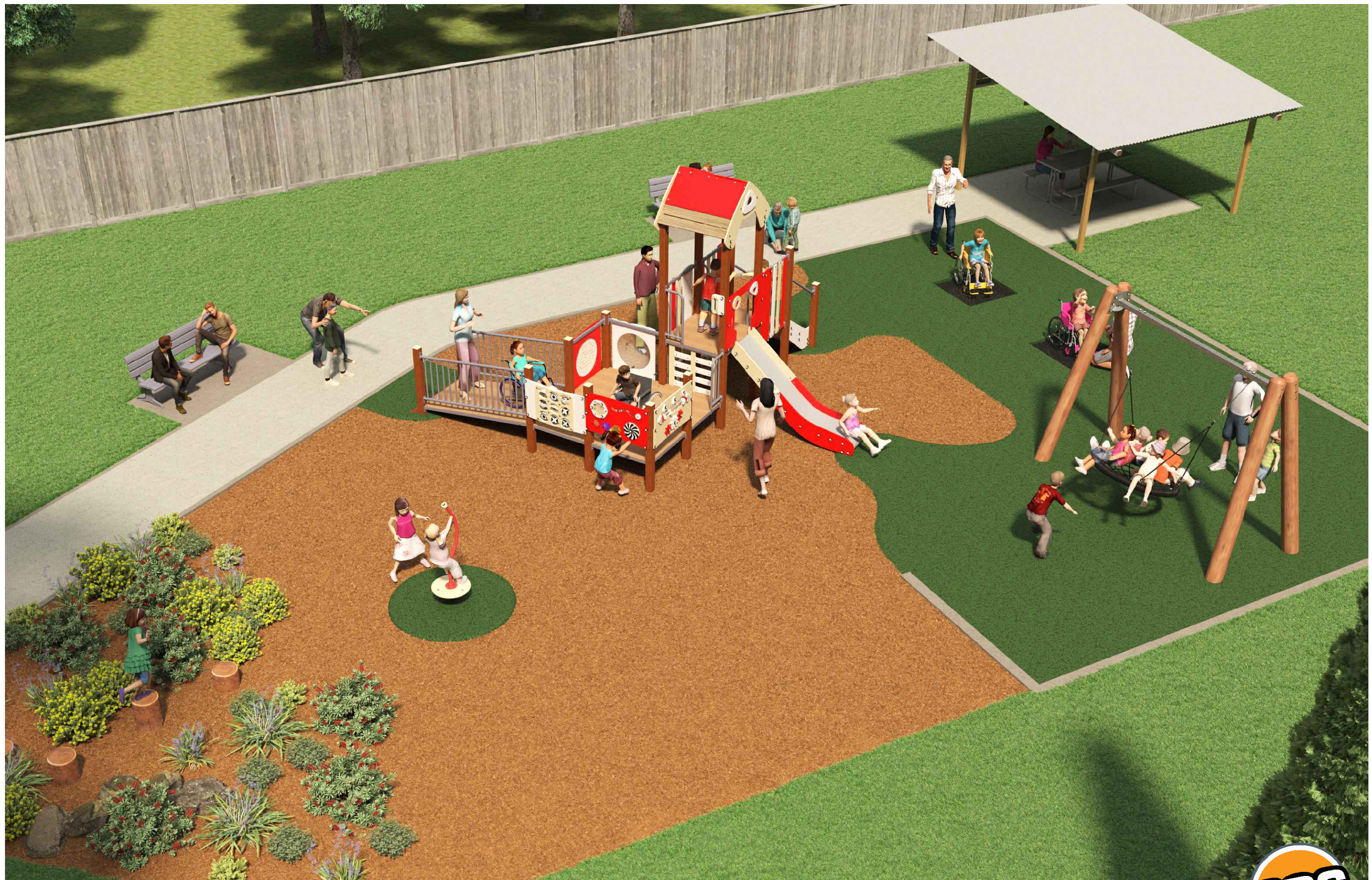
CHURCH RD. PLAYGROUND - WINGECARRIBEE S.C. - OPTION 2 - #2247