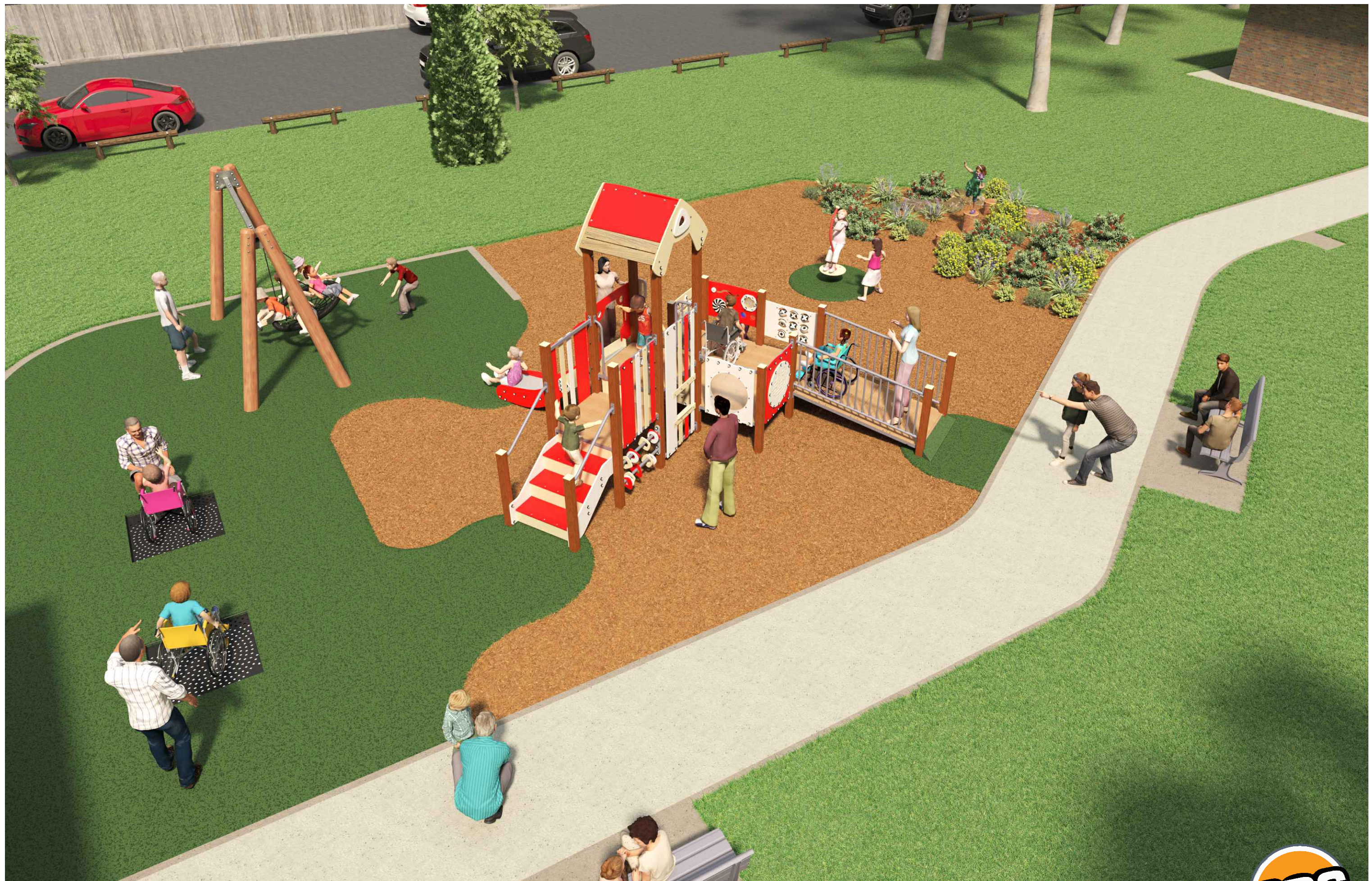
CHURCH RD. PLAYGROUND - WINGECARRIBEE S.C. - OPTION 2 - #2247