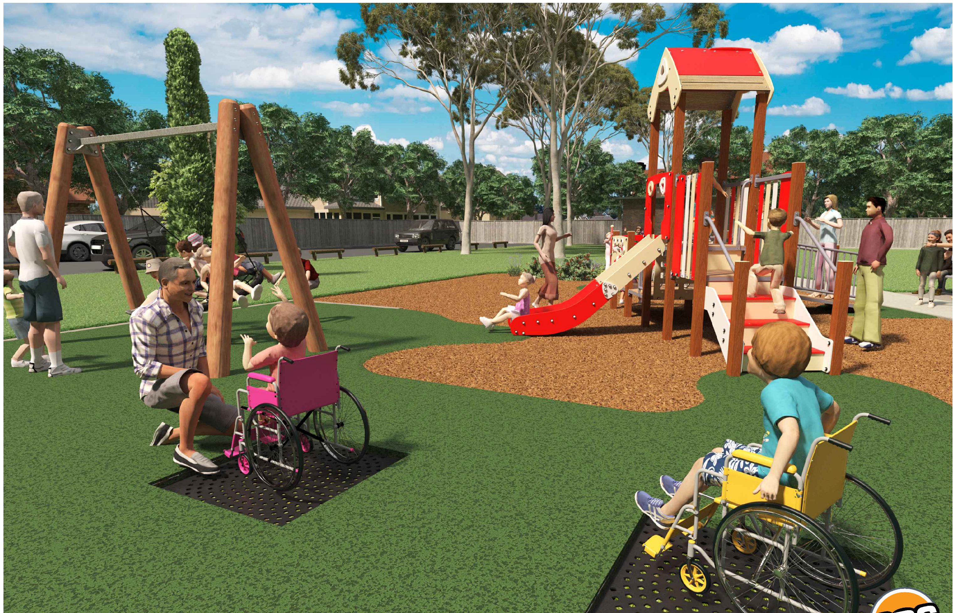
CHURCH RD. PLAYGROUND - WINGECARRIBEE S.C. - OPTION 2 - #2247